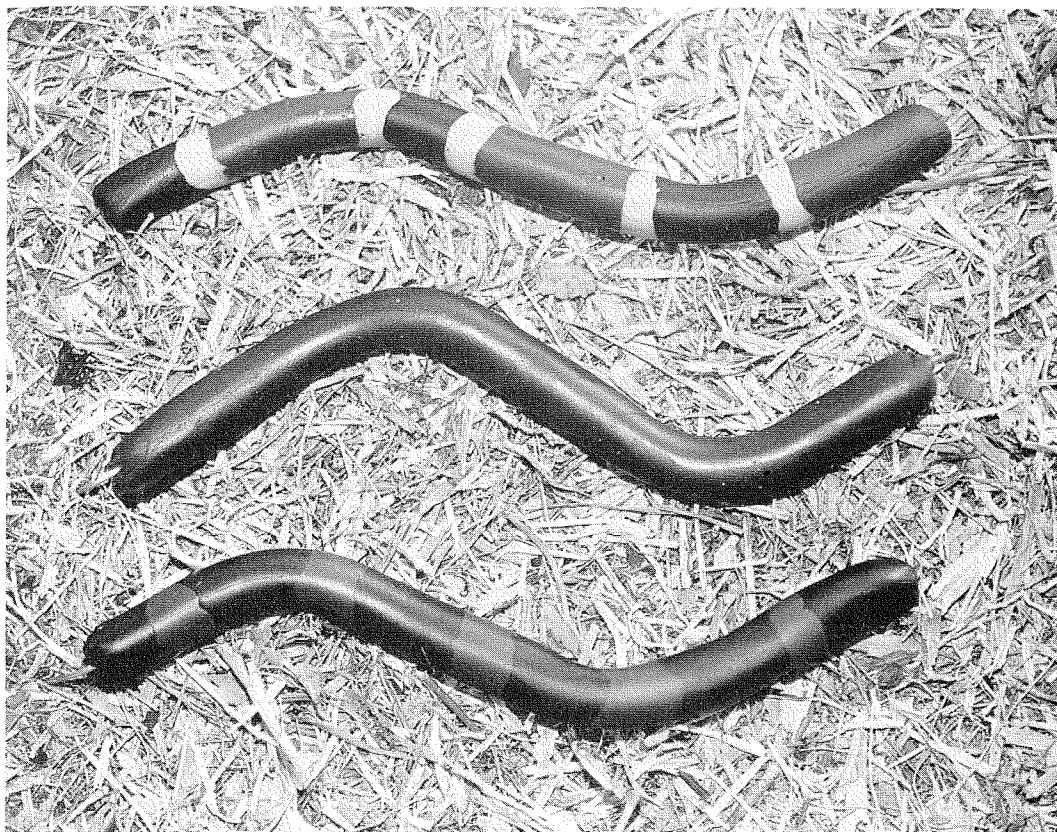
FIG. 1. Tricolor (top), unmarked brown (middle), and bicolor (bottom) plasticine replicas placed on a semi-natural background for illustrative purposes. Yellow bands appear white, red bands appear dark gray, and both black bands and the brown replica appear black in the photograph.

The black iguana or ctenosaur ( Ctenosaura similis : Iguanidae) is among the minority of lizard species that are primarily herbivorous (Hotton, 1955; Fitch and Hackforth-Jones, 1983). These large, diurnal lizards associate mainly with dry forest and scrub habitats from southern Mexico to Panama (Fitch and Hackforth-Jones, 1983). Ctenosaurs eat most available succulent vegetation when food is abundant, but become selective in the dry season when resources are scarce. For example, during the dry season in Costa Rica, ctenosaurs reportedly travel unusually great distances (>100 m) to consume the yellow flowers of Tabebuia spp. (Bignoniaceae) (Fitch and Henderson, 1978; Fitch and Hackforth-Jones, 1983). Although these flowers may produce a detectable odor, few trees contain leaves at this time of year in the dry forest of Costa Rica; hence the ability to visually detect flowering trees may be considerable. Nonetheless, the sensory mechanism (olfactory or visual) used by ctenosaurs to locate these patchily-distributed resources is unknown.